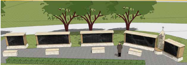
Architectural drawing of future additions to the current Columbarium.

* Other circumstances will be taken under consideration.